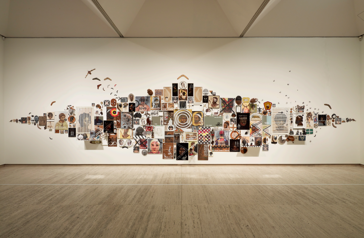
Projecting Our Future , 2013, from the The History Trilogy , installation made up of reworked objects, sculptures, and paintings; original paintings, drawings and photographs; and three unique artworks by Daniel Boyd, Dale Harding and TextaQueen, dimensions variable, approximately 280 x 1200 cm. Installed at Art Gallery of New South Wales, Sydney