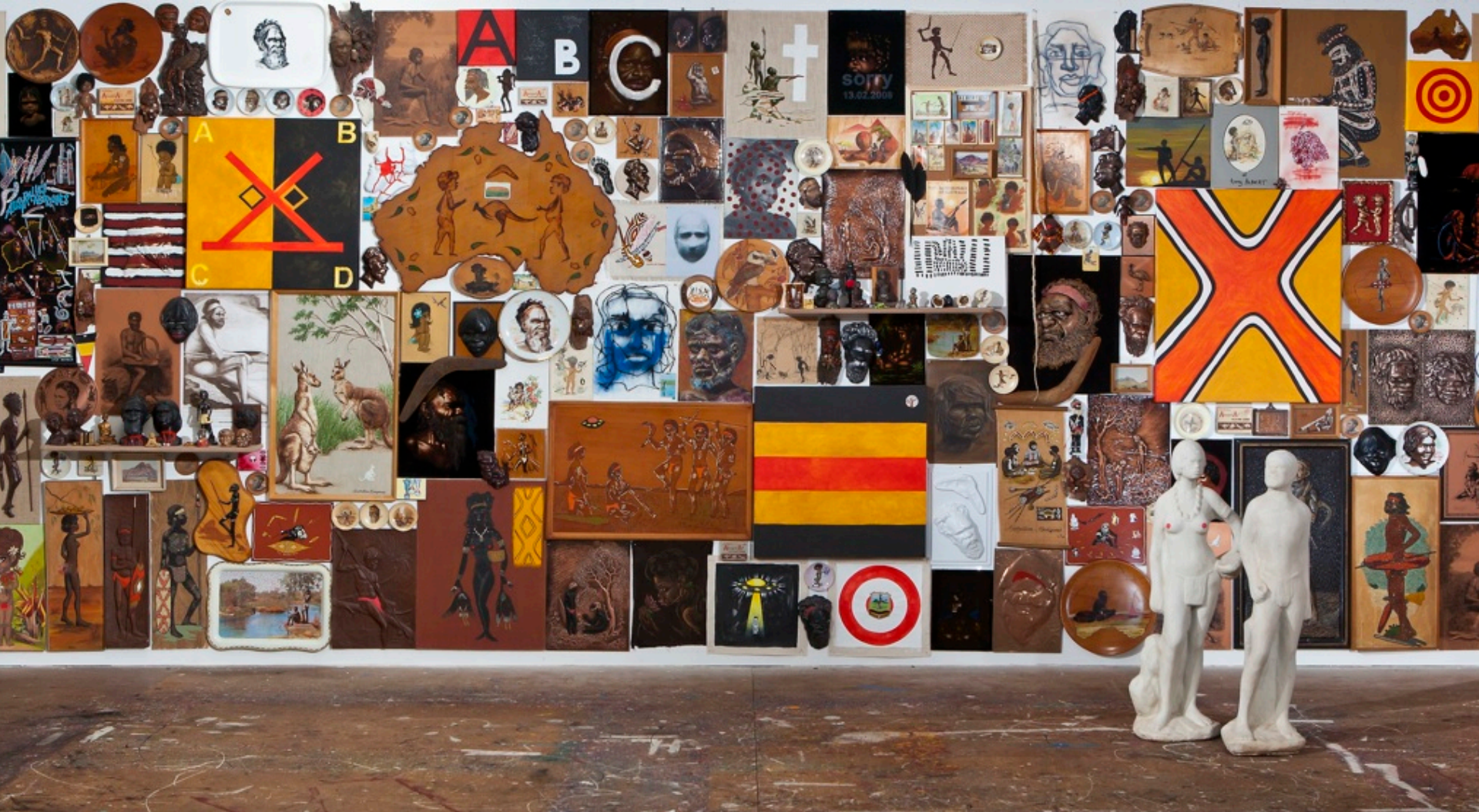
Detail of A Collected History , 2010, from the The History Trilogy . Installation comprising hundreds of re-worked objects, sculptures and paintings, original paintings and drawings, and three unique artworks contributed by Vernon Ah Kee, Shane Cotton and Arthur Pambeanu Jr. 240 x 600 cm. Installed at the Tel Aviv Museum of Art, Israel