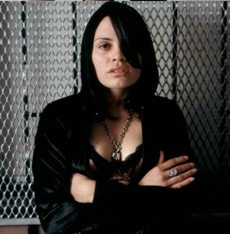
50 Percent, 2006, Series of Type-C photographs 100 x 100 cms each