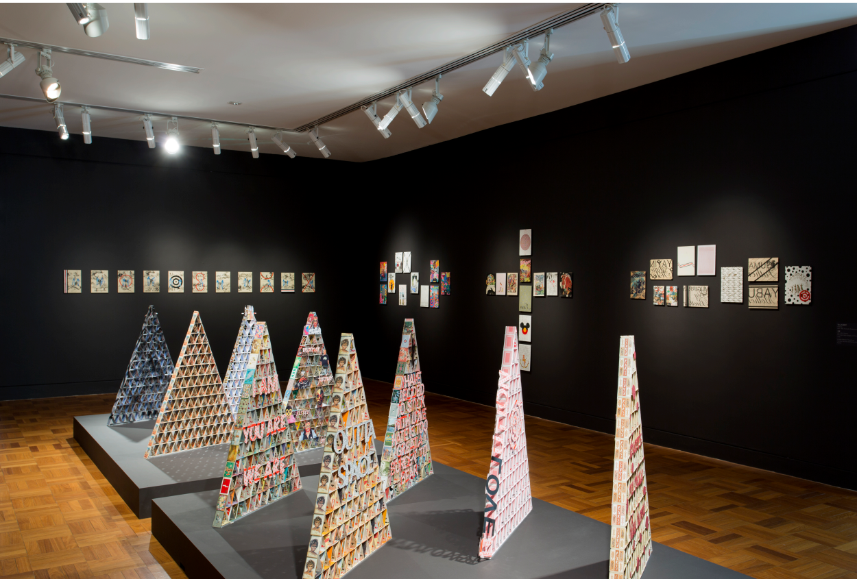
108, 2014, 99 mixed media collages and 9 house of cards, dimensions variable. Installed at the Art Gallery of South Australia, Adelaide