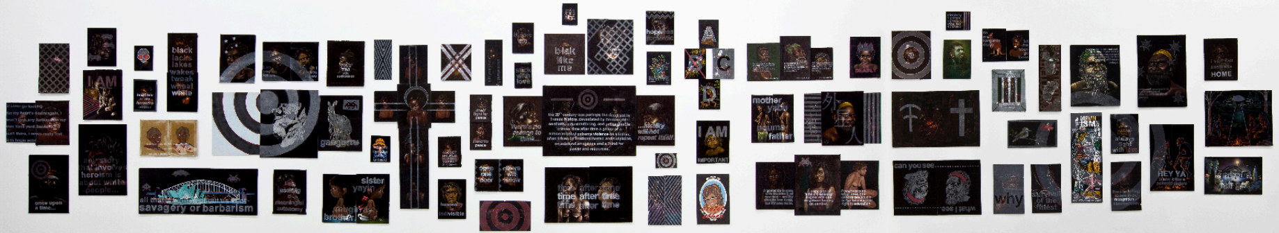
Rearranging Our History , 2002 - 2011, from the The History Trilogy , installation of 97 reworked velvet paintings, dimensions variable, approximately 200 x 1150 cm.