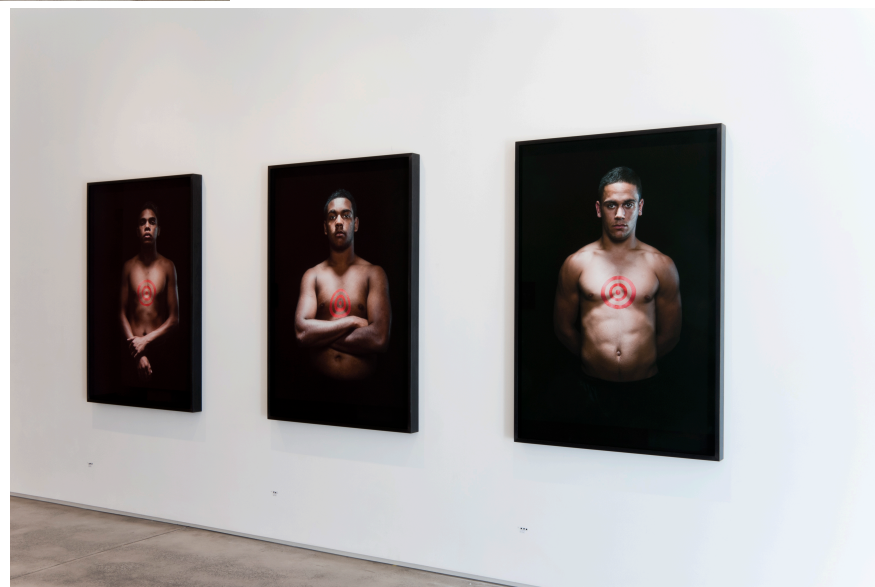
Brothers: Our Past Present Future , 2012-13, pigment print on paper, 150 x 100 cm each. Exhibited at Sullivan + Strumpf, Sydney