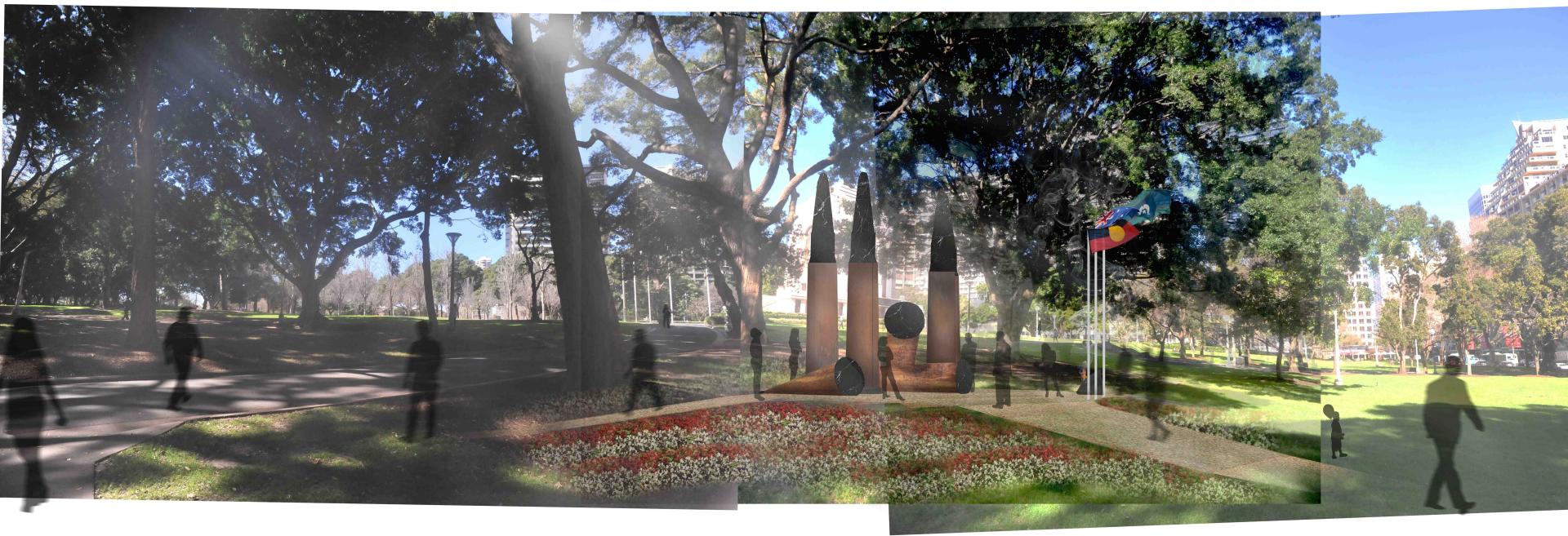
Artist impression of Yininmadyemi - thou didst let fall , 2015, Hyde Park, Sydney