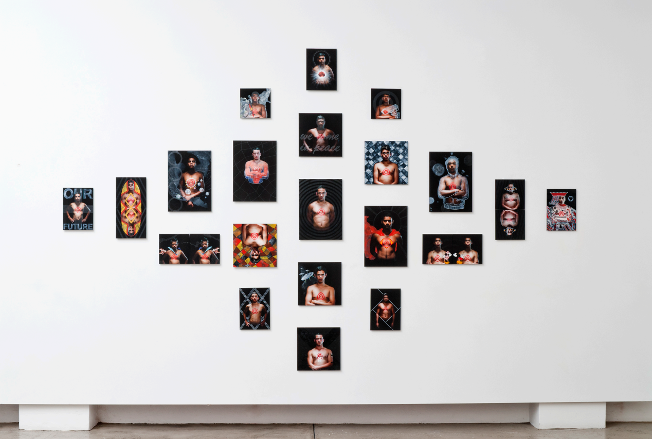
Brothers: Our Past Present Future , 2012-13, 21 acrylic and gloss medium on pigment print mounted to aluminium, 210 x 280 cm. Exhibited at Sullivan + Strumpf, Sydney