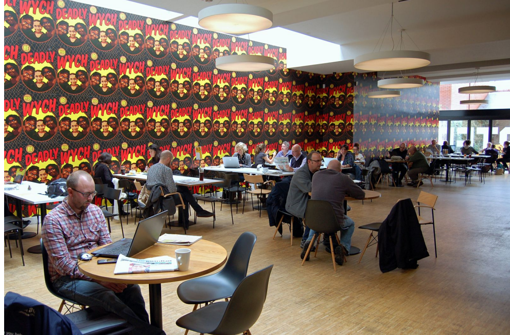
Be Deadly, 2011–13, Posters, Installed at the Cairns Indigenous Art Fair (2011), in Cardiff, Wales in 2012, at the Exchange Gallery (2013)