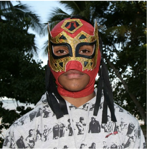
No Place, 2009, Series of Type-C Photographs, 100 x 100 cm each