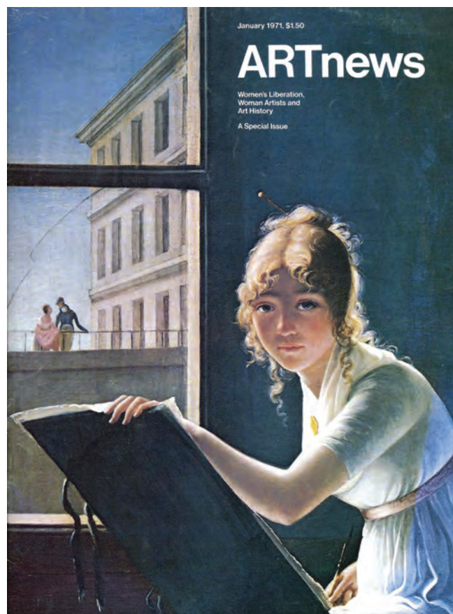
Illustration: ARTnews , January 1971. Marie-Denise Villers, Portrait of Charlotte du Val d'Ognes , 1801, Metropolitan Museum of Art.